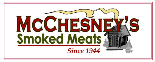
Smoked Turkey see page 2