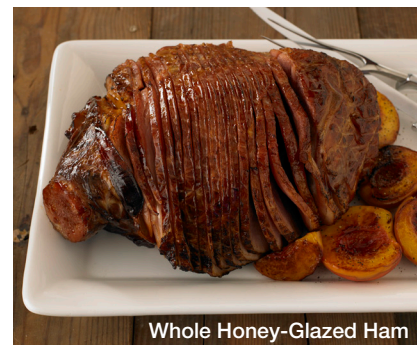
Whole Honey-Glazed Ham