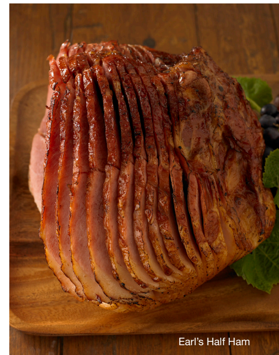
Earl's Half Ham